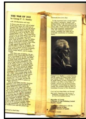
War of 1812